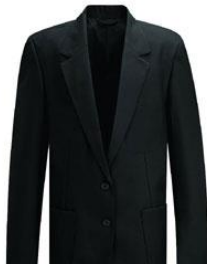
Ziggy's Blazer - Girls (With Logo)