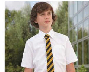
SHORT SLEEVE SHIRT TWIN PACK NON IRON