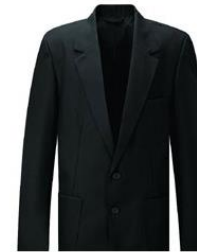
Ziggy's Blazer - Boys (With Logo)